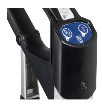
You will remain in full control of the scrubber dryer thanks to the intuitive touch display with two water settings and a solution indicator, alerting you if the tank is empty