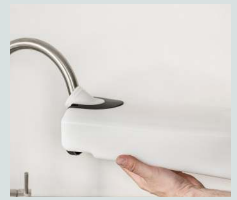
Easy to fill the solution tank with water in any low sink