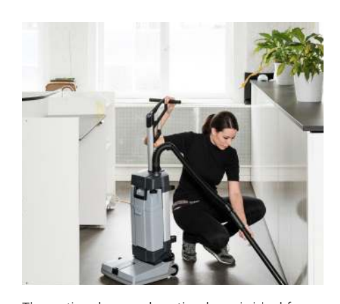
The optional manual suction hose is ideal for cleaning any unreachable area or spot cleaning.