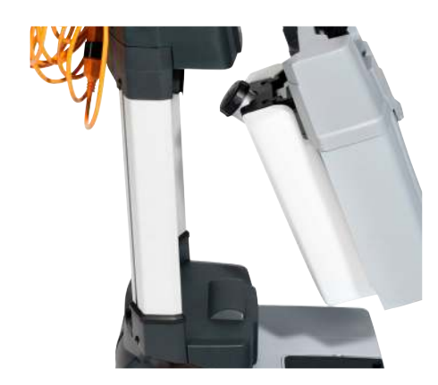
Each tank can be removed quickly and carried in one hand.