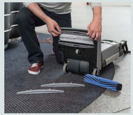
Apart from getting faster cleaning of hard floors, you will also be able to freshen up smaller carpets, including removal of spots, by adding an optional carpet kit. Brush and squeegees can be removed without any tool making daily maintance operations easy and fast