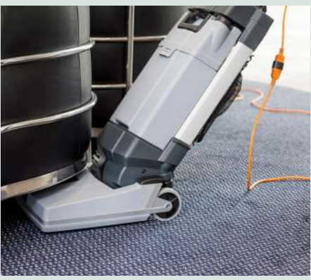
The SC100 clean in a position height of just 25 cm